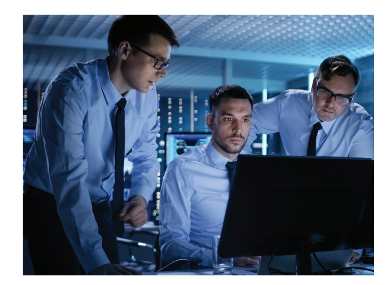
With the objective of zero compliance violations and a new level of security, a converged solution is the best way to close the security gaps and deliver automated policy and compliance enforcement.

Unified Threat Management: Physical Threats, Insider Threats, Cyber Threats and Advanced Persistent Threats: Gain a unified view of threats across the enterprise and deploy rules-based solutions to prevent malicious acts, sabotage, terrorism and cyber threats.